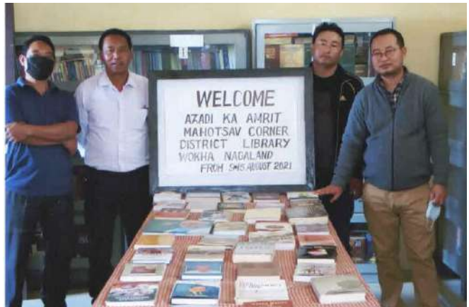
District Library, Wokha