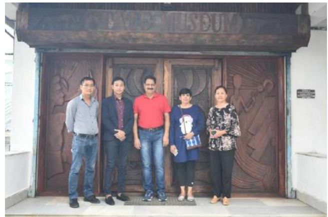
Shri. Ravinder Chaudhry, General Secretary of Athletics Federation of India (AFIINDIA)