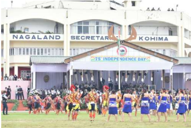
75 th Independence Day 2021

c). 73 rd Republic Day, 2022: During the celebration of Republic Day on 26 th January, 2022, at Nagaland Civil Secretariat Plaza, the Department organized five (5) cultural troupes and participated in the Cultural presentation: 1). Rengma Cultural Troupe 2). Khamniungan Cultural Troupe 3). Lotha Cultural Troupe 4). Pochury Cultural Troupe and 5). Sumi Cultural Troupe.