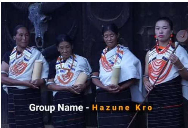
Group Name - Hazune Kro