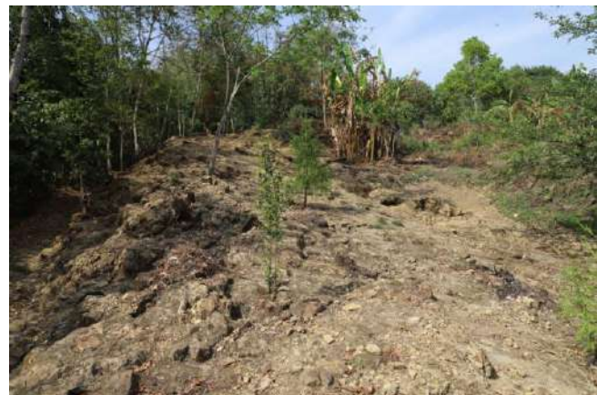
Chungliyimti – Longtrok in Tuensang District