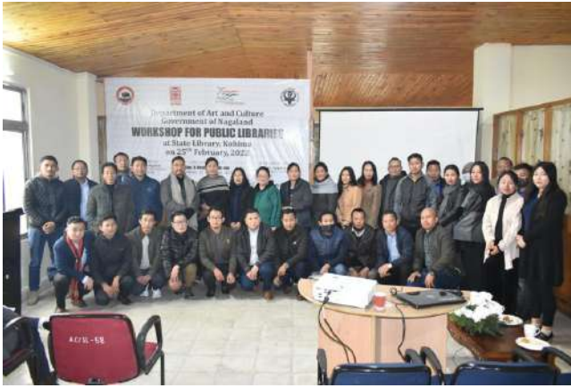
Participants at the Workshop for Public Libraries