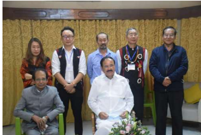
Hon'ble Vice President of India, Shri. M. Venkaiah Naidu with the five recipients of the Governor's Award