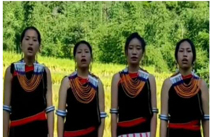
Küzüve Kro 2 nd position