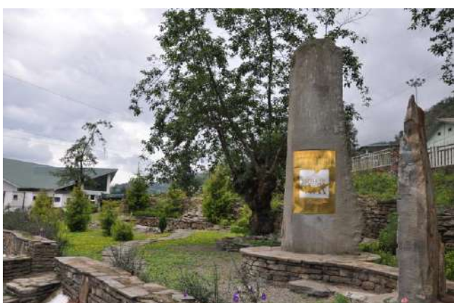
Peace Garden, WWII Museum