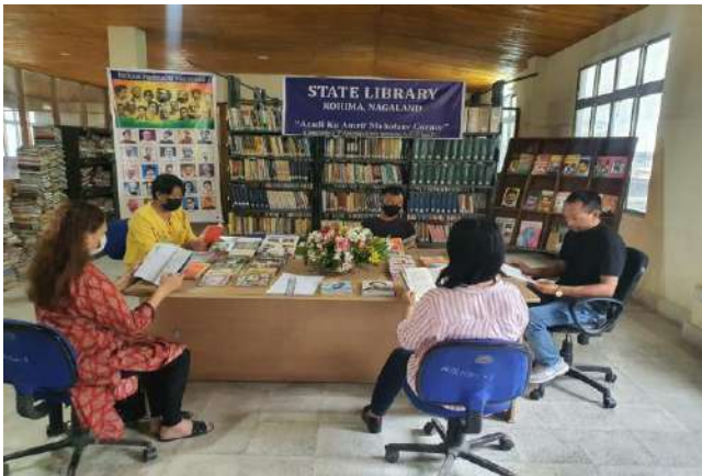
State Library, Kohima

f). In the ongoing celebration of 75 th Anniversary of India's Independence "Azadi Ka Amrit Mahotsav", as a part of Raja Rammohun Roy Library Foundation, Kolkata program, the Department organized a week long 'Azadi Ka Amrit Mahotsav Corner' in the State Library, Museum Library and all the District Libraries during the occasions of Independence Day (9 th to 15 th August, 2021), Constitution Day (28 th November to 4 th December, 2021) and Republic Day (26 th January to 1 st February, 2022). Books on Freedom Movement, Posters/Photographs etc. were displayed in the Corners during the events.