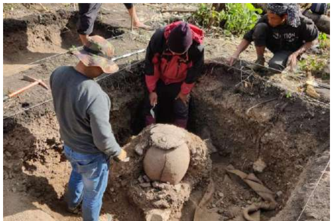
Excavation of burial jar at Old Thewati area.

Nagaland has many legendary sites, ancient monuments, traditional water sources and places of historical significance. As these constitute our collective cultural heritage, protection, improvements and developing works on some sites have been carried out.