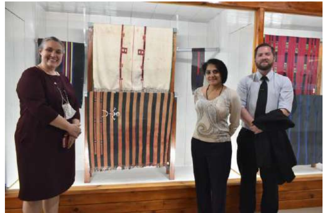
Consul General of United States, Melinda Pavek at the Textile Gallery, State Museum, Kohima