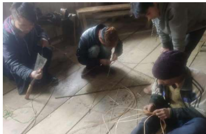
Workshop on Skill Upgradation and Training in Traditional Art & Crafts 2021-22, Noklak