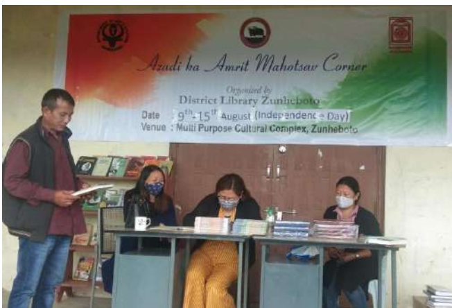
District Library, Zunheboto