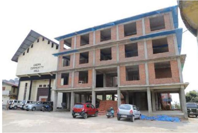
Library cum Museum at Ungma, Mokokchung