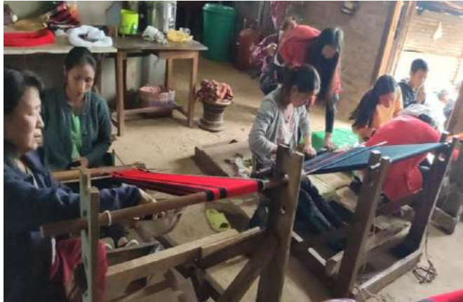
Workshop on Skill Upgradation and Training in Traditional Art & Crafts 2021-22, Mon