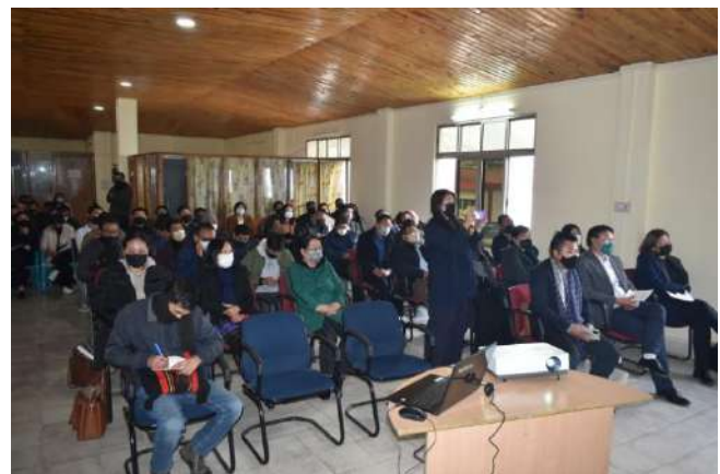
Participants at the Workshop for Public Libraries