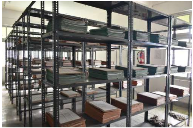
Stack Room, State Archives, Kohima