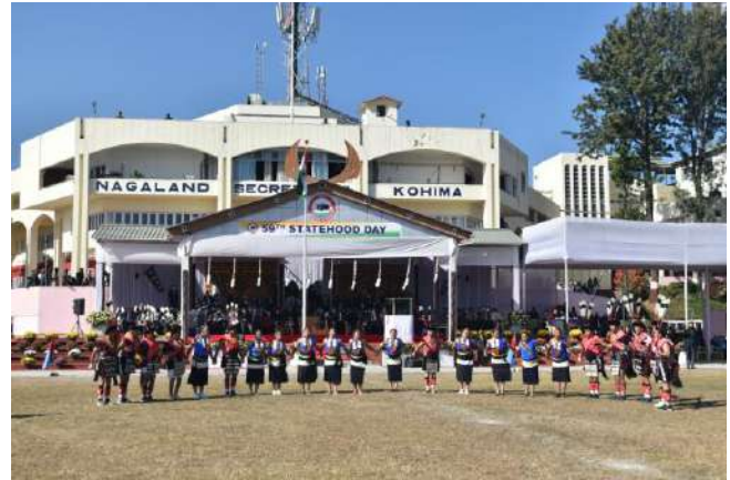
Nagaland Statehood Day 2021