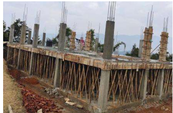
Museum at Tsaru Village, Tuensang District