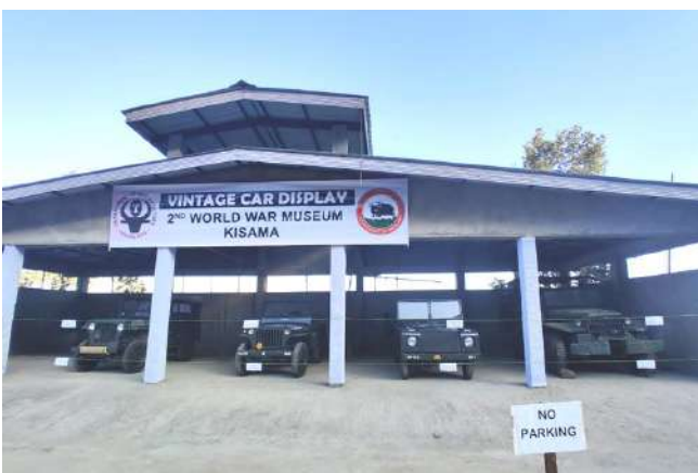
Vintage Car Display at WWII Museum, Kisama