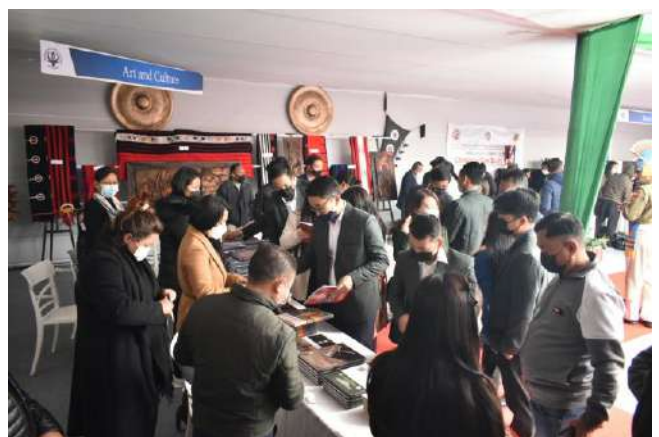
Officers & staff (left) and visitors (right) at the Department's stall, Nagaland Civil Secretariat Plaza on the 73 rd Republic Day, 26 th January, 2022