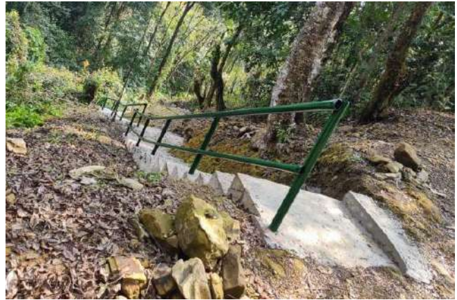
Newly constructed toilet and foot steps at Chungliyimti - Longtrok