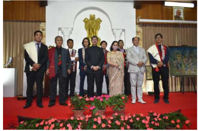
Awardees with the Hon'ble Governor Shri. R.N.Ravi

c). The Department organized 'Artist Corner' at Kisama during the Hornbill Festival, 2021 and various artists exhibited their Art works.