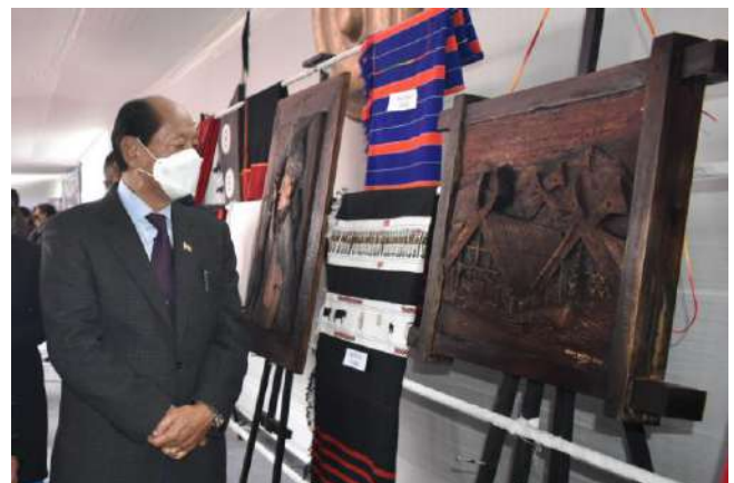
73 rd Republic Day, 2022 and Hon'ble Chief Minister Shri. Neiphiu Rio visiting the Department's stall