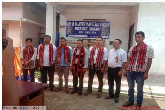
District Library, Mon